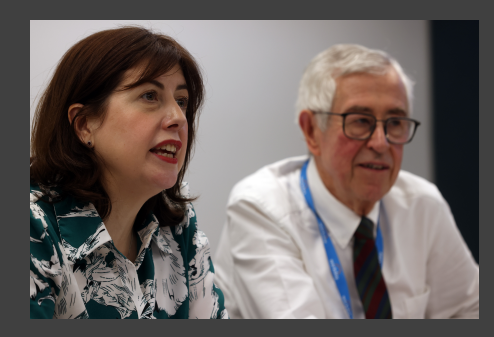
16 April 2024